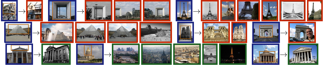
Figure 2. Examples of extreme labeling mistakes in the original labeling. We show the query (blue) image and the associated database images that were originally marked as negative (red) or positive (green). Best viewed in color.