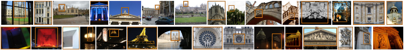
Figure 1. The newly added queries for \mathcal{R}Oxford (top) and \mathcal{R}Paris (bottom) datasets. Merged with the original queries, they comprise a new set of 70 queries in total.