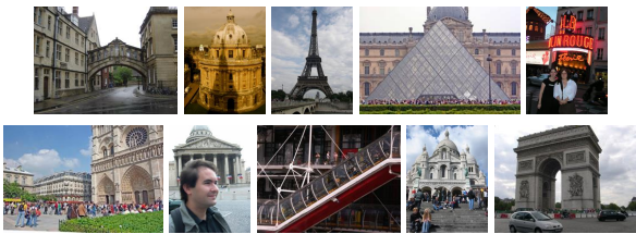
Figure 4. Sample false negative images in Oxford100k.

The original annotation and evaluation protocol is closest to our Easy setup. Even though this setup is now trivial for the best performing methods, it can still be used for evaluation of e.g. near duplicate detection or retrieval with ultra short codes. The other setups, Medium and Hard , are challenging and even the best performing methods achieve relatively low scores. See Section 4 for details.