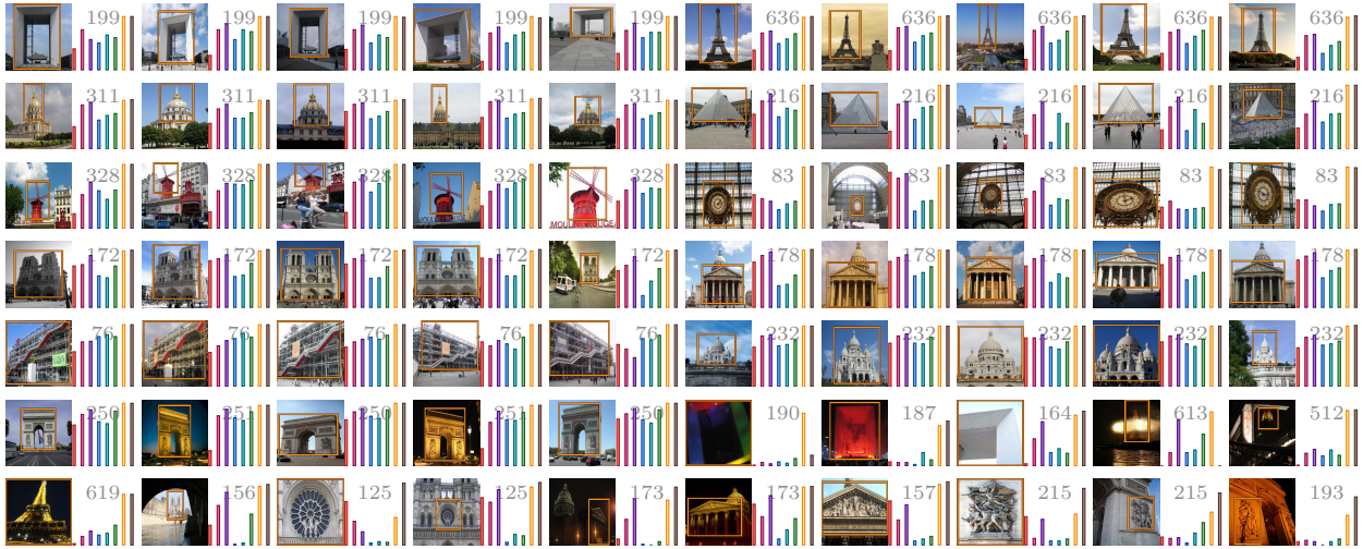
Figure 7. Performance (AP) per query on \mathcal{R}Paris + \mathcal{R}1M with Medium setup. AP is shown with a bar for 8 methods. The methods, from left to right, are HesAff-rSIFT-ASMK + +SP , DELf-ASMK + +SP , DELf-HQE+SP , V-[O]-R-MAC , R-[O]-GeM , R-[37]-GeM , R-[37]-GeM+DFS , HesAff-rSIFT-ASMK + +SP → R-[37]-GeM+DFS . The total number of easy and hard images is printed on each histogram. Best viewed in color.

sion performs similarity propagation by starting from the query’s nearest neighbors according to the CNN global descriptor. This inevitably includes false positives, especially in the case of few relevant images. On the other hand, local features, e.g. with ASMK + +SP, offer a verified list of relevant images. Starting the diffusion process from geometrically verified images obtained by BoW methods combines the benefits of the two worlds. This combined approach, shown at the bottom part of Table 5, improves the performance and supports the message that both worlds have their own benefits. Of course this experiment is expensive and we perform it to merely show a possible direction to improve CNN global descriptors. There are more methods that combine CNNs and local features [53], but we focus on the results related to methods included in our evaluation.