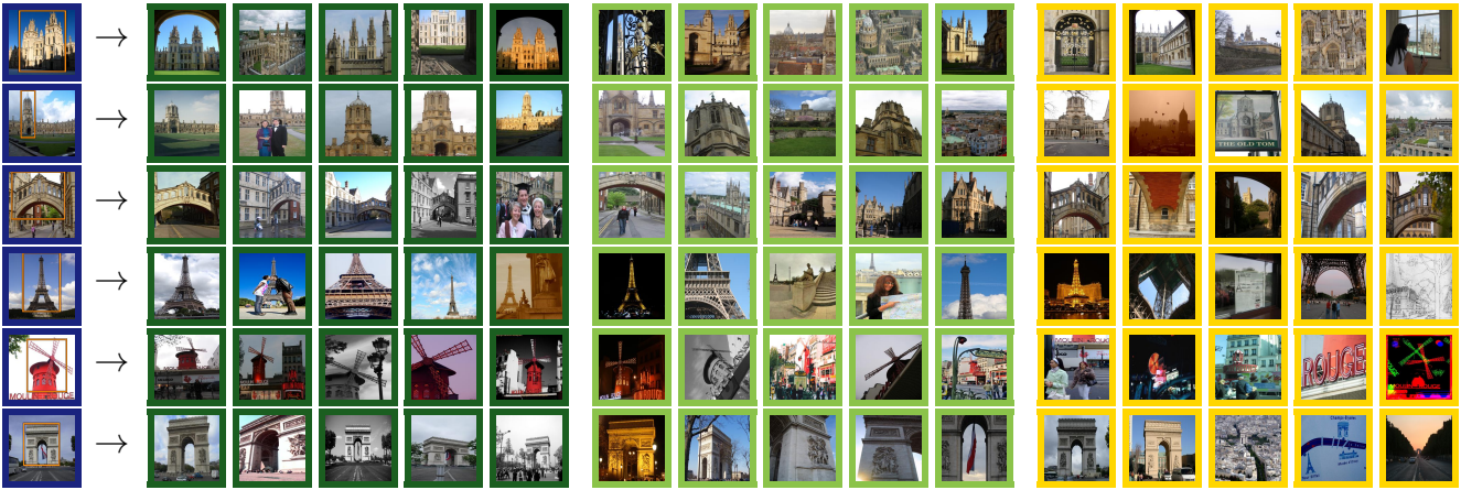
Figure 3. Sample query (blue) images and images that are respectively marked as easy (dark green), hard (light green), and unclear (yellow). Best viewed in color.