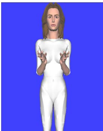
Fig. 2. The virtual signer signing “radio” in GSL

An integrated system based on STEP is usually deployed in a usual HTML page, in order to maximize interoperability and be accessible to as many users as possible. This page includes an embedded VRML object, which represents the avatar and includes references to the STEP engine and the related JavaScript interface. From this setup, one may choose to create their own script, for sign representation, and execute them independently, or embed them as JavaScript code, for maximized extensibility. The common VRML viewing plug-ins offer the possibility to select the required viewpoint at run-time, so it is possible for the user to experience the signing from any desired point of view [10], [11], [12]. As an example, a frame of the signing sequence for “radio” is presented in figure 2.