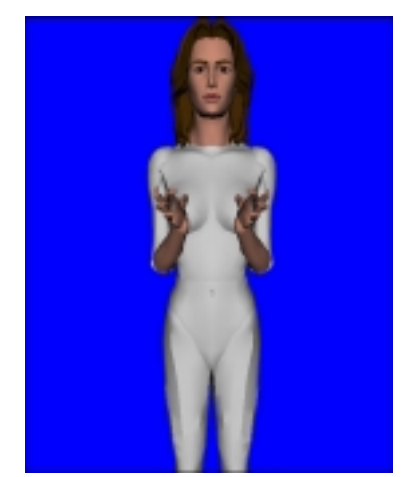
Figure 2: The virtual signer signing "radio" in GSL

An integrated system based on STEP is usually deployed in a usual HTML page, in order to maximize interoperability and be accessible to as many users as possible. This page includes an embedded VRML object, which represents the avatar and includes references to the STEP engine and the related JavaScript interface. From this setup, one may choose to create their own script, for sign representation, and execute them independently, or embed them as JavaScript code, for maximized extensibility. The common VRML viewing plug-ins offer the possibility to select the required viewpoint at run-time, so it is possible for the user to experience the signing from any desired point of view [10], [11], [12]. As an example, a frame of the signing sequence for "radio" is presented in figure 2.