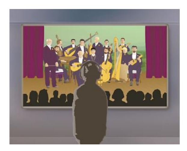
Fig. 1. MusicKiosk: an interface built for entertainment purposes

Musickiosk is an exhibit in the National Academy of Santa Cecilia ( Accademia Nazionale di Santa Cecilia [12], one of the world's oldest music institutes) in Rome. It uses multiple modalities as input and synthesizes a composite output comprised of music and visual animation. MusicKiosk is a walk-through installation of four consecutive rooms. Each room is equipped with cameras that monitor user behaviour. It takes inputs from "Shelf Components", accessed via the CALLAS Framework, and uses these to drive a cartoon-based story on the screen, and to generate music [14]. The design goal is to adapt the interface to the user's affective reactions and thus deliver a more engaging and customised entertaining experience. The audience is encouraged to interact with the showcase through words, emotional speech and facial expressions. The perceived emotion of these inputs is used to influence the mood of the main cartoon character, the animated musicians and of the music generated by the kiosk.